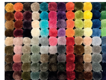
CHOOSE ONE OF OUR 108 COLOURS